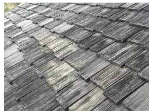
The colors shown in this brochure or our website may vary from actual colors. Before making a final selection, be sure to review actual material samples and roof installations.